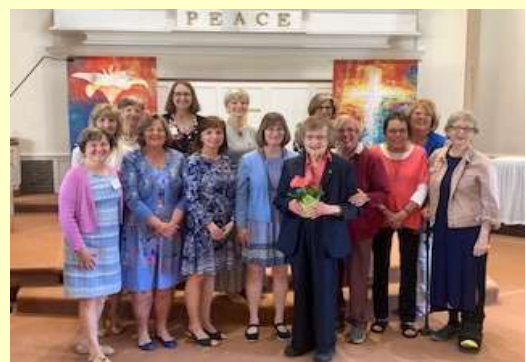
Participants of UMW Sunday Service