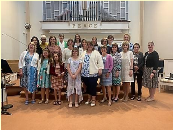
Hudson United Women in Faith