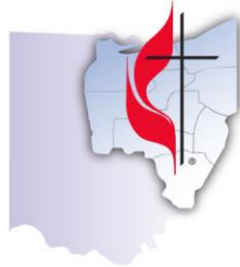
East Ohio Conference The United Methodist Church

The 54 th Session of the East Ohio Annual Conference will be held Thursday, June 8 through Saturday, June 10, 2023 . The theme this year is "Faith Hope Love" The scriptural focus is 1 Thessalonians 1:2-3. Annual Conference will be held at John S. Knight Center (Akron University)