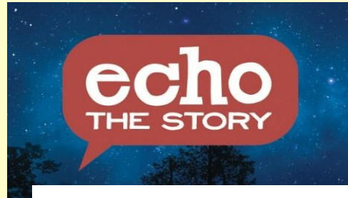
Sparkhouse's Echo the Story 36 for Grades 6-12

My goal for our kids' Sunday school is for them to spend that time forming a "big picture" of what God is doing in the world and also their place in it. I also want them to feel encouraged and empowered to process ideas and seek answers to their compelling questions. I hope that they form significant, caring relationships with each other as well as with their adult leaders. And finally, I want them to enjoy their time here and feel valued in their church.