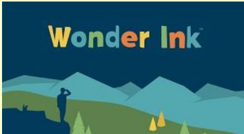
David C. Cook's Wonder Ink for Pre-Grade 1 and Grades 2-5

(Right-click on the images to open the video links.)